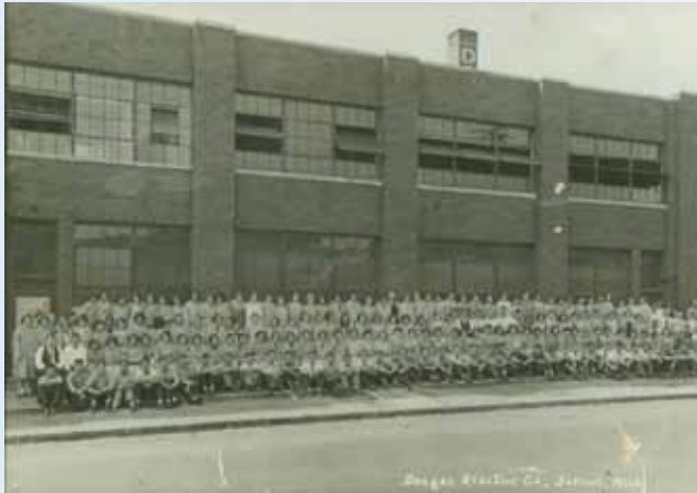
Dongan factory photo circa 1923

Dongan Electric was founded in Albany New York in the year 1909. We moved to Detroit in 1911 to supply products to the young automobile industry at that time. Today we are still headquartered in the original plant however our manufacturing is now located in Pioneer Ohio. We also have manufacturing facilities in Italy, China and also a JV in India.